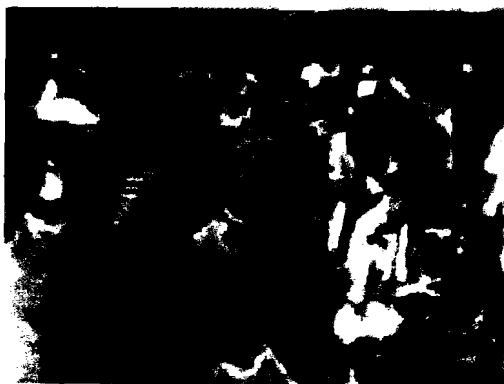
A Tribal ceremony

On the morning of the appointed day of monkey-hunt, the Naya bathes in a stream or spring, fills a pot with water and brings it home. He changes his loin-cloth, and in the company of one or two elders proceeds with a handful of aura rice and the water-pot to the Jily-Jayar which his wife has already cleaned with mud or cowdung. The Kotwar has placed there all the nets of the intending hunters. Before this heap of nets, the Naya stands on his left leg with his right heel resting on his left knee ( Fig. 1 ), and with his face to the east and with arms extended forward, pours a little of water three times on the ground, invokes all the spirits by name for success in hunting: