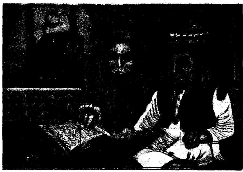
Mohammedan mother teaching a child to read the Holy Quran, the main scripture of Islam.

Through these practices of devotion, a Muslim becomes the master over his passions and desires and attains, through worship and observance of Islamic rules, the apex of dignity, human conduct and elevation of mind.