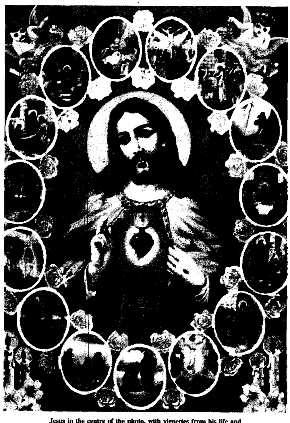
Jesus in the centre of the photo, with vignettes from his life and teachings depicted all around him.

In its adaptation to the 'world', there is no question of the church's accepting the world totally in spirit and in fact, for that would amount to a negation of the